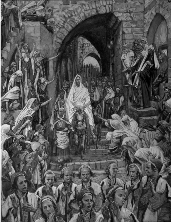
James Tissot (1836–1902), Le cortège dans les rues de Jérusalem

Palm Sunday & Sunday of the Passion 13 April 2014